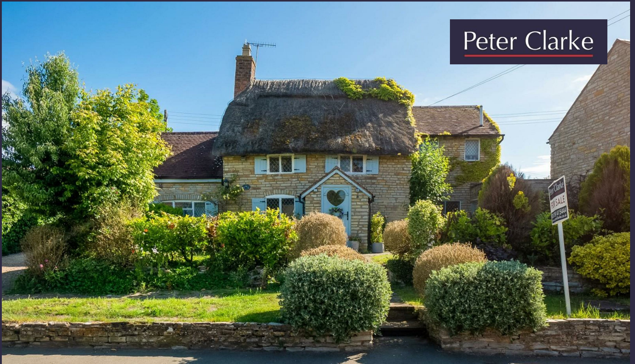
Little Dene Cottage, 170 Binton, Stratford-upon-Avon, CV37 9TW