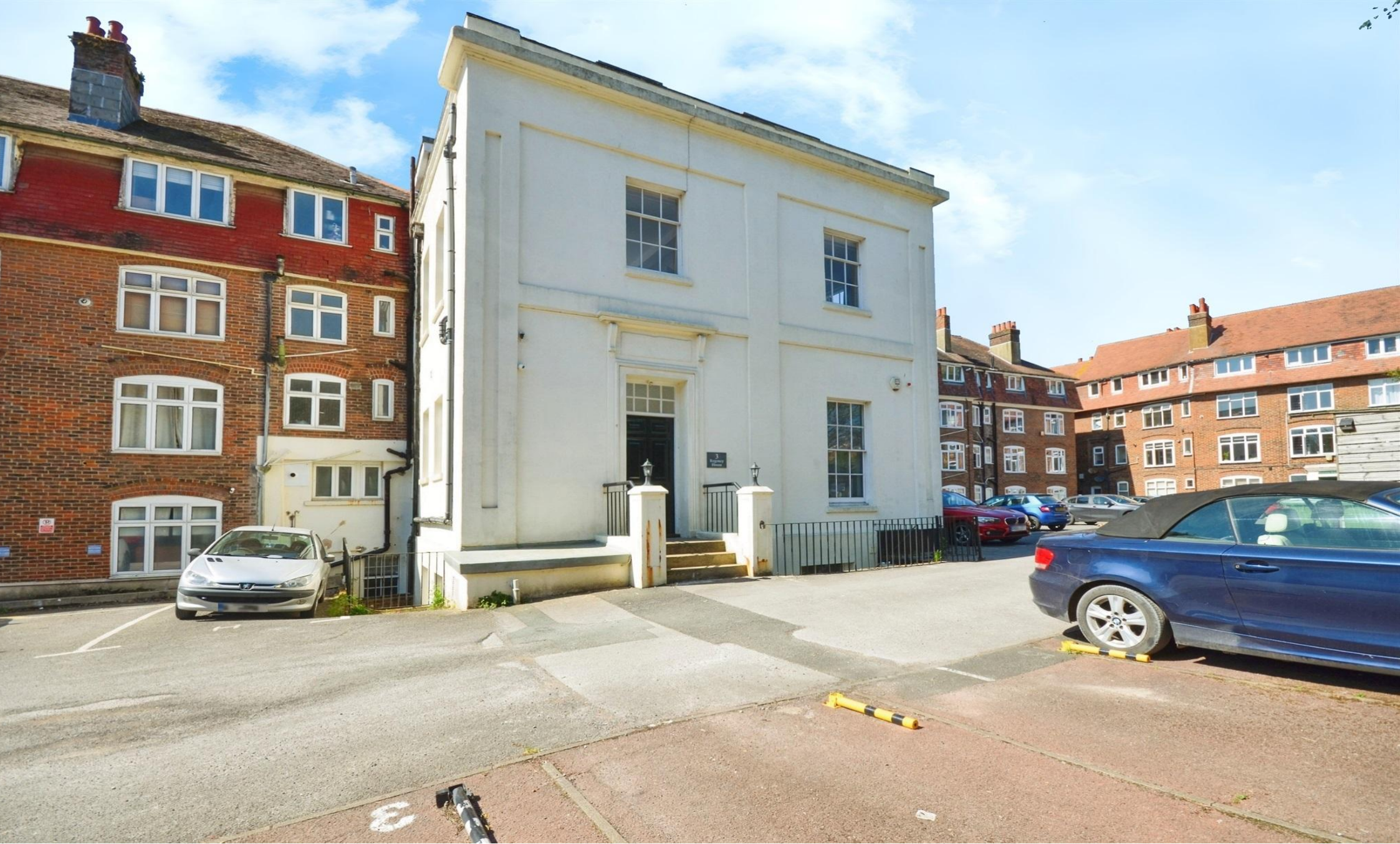
Regency House, Grosvenor Square, Southampton SO15 2BE