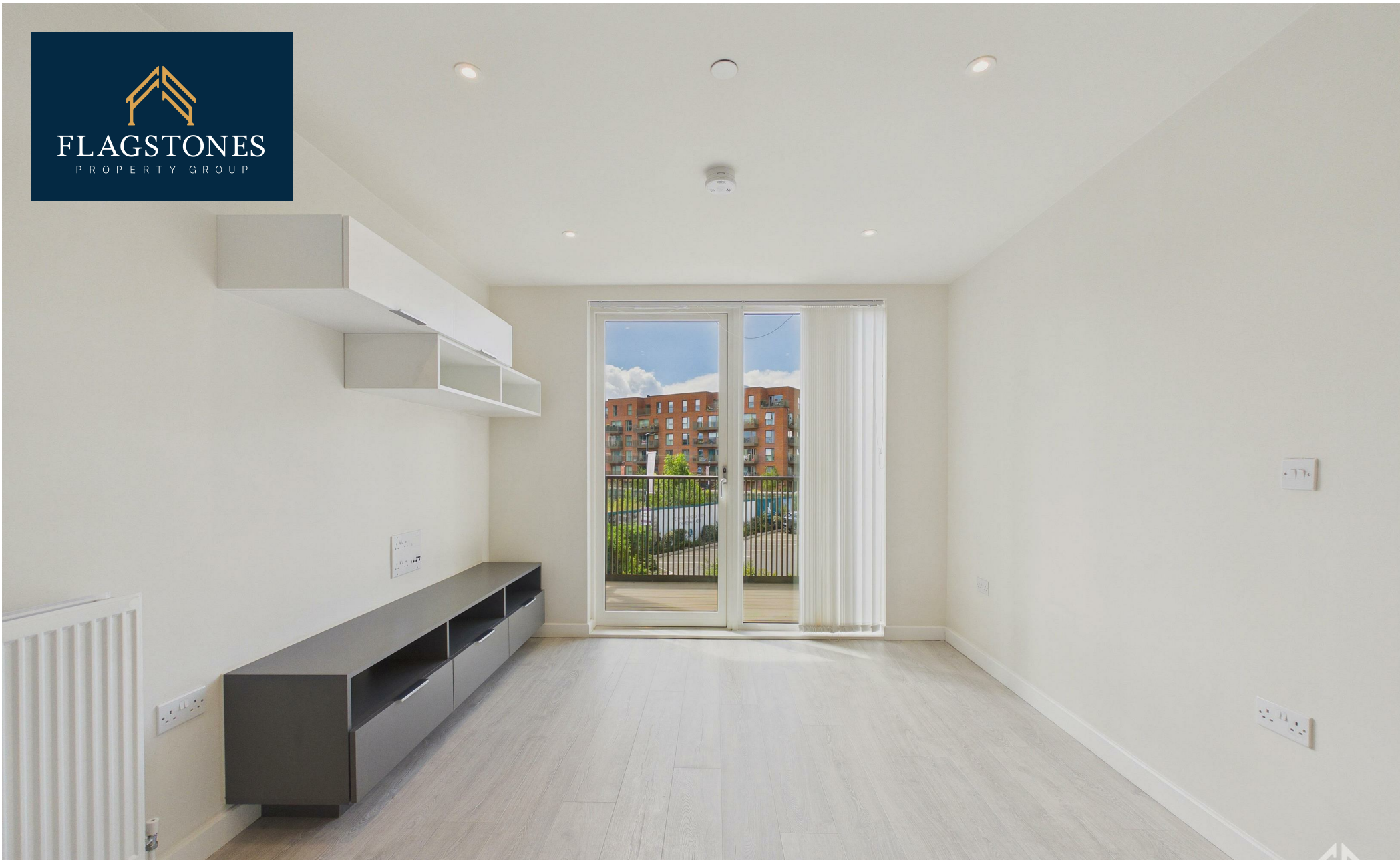
1, 6 Testino Apartments Henry Strong Road, Harrow, HA1 4BG £1,475 Per month