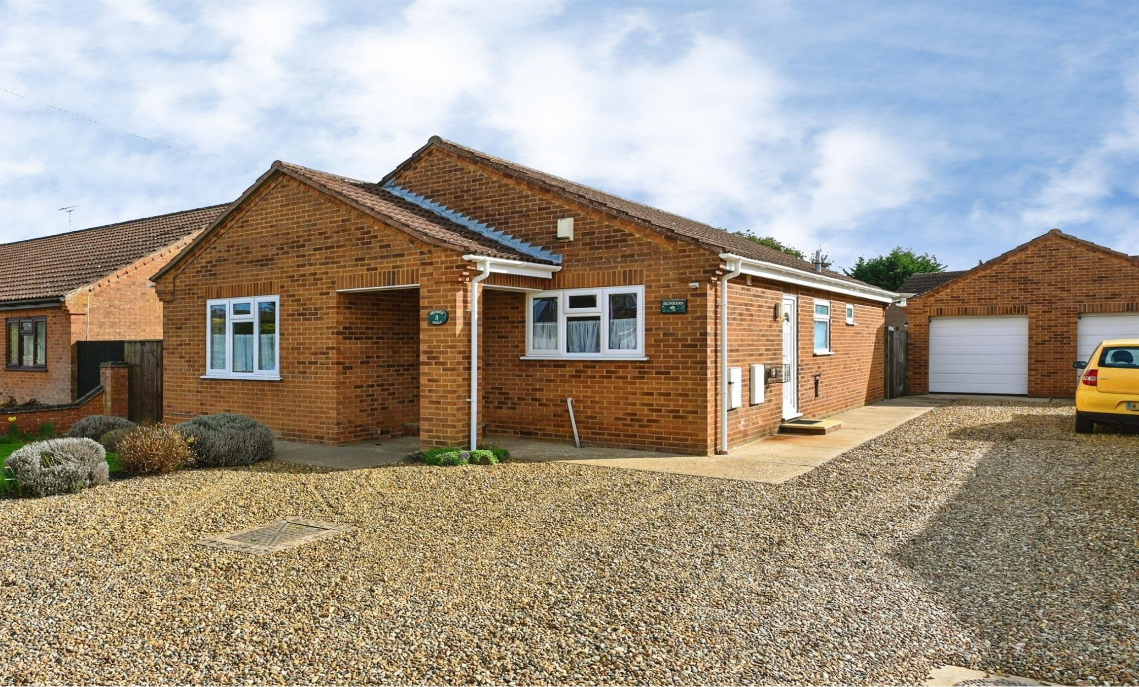
Premier Mills, Terrington St. Clement, KING'S LYNN, PE34 4DU