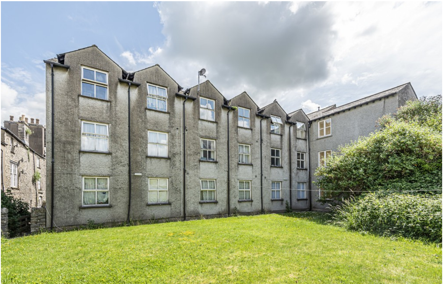
Rear of Property and Communal Garden