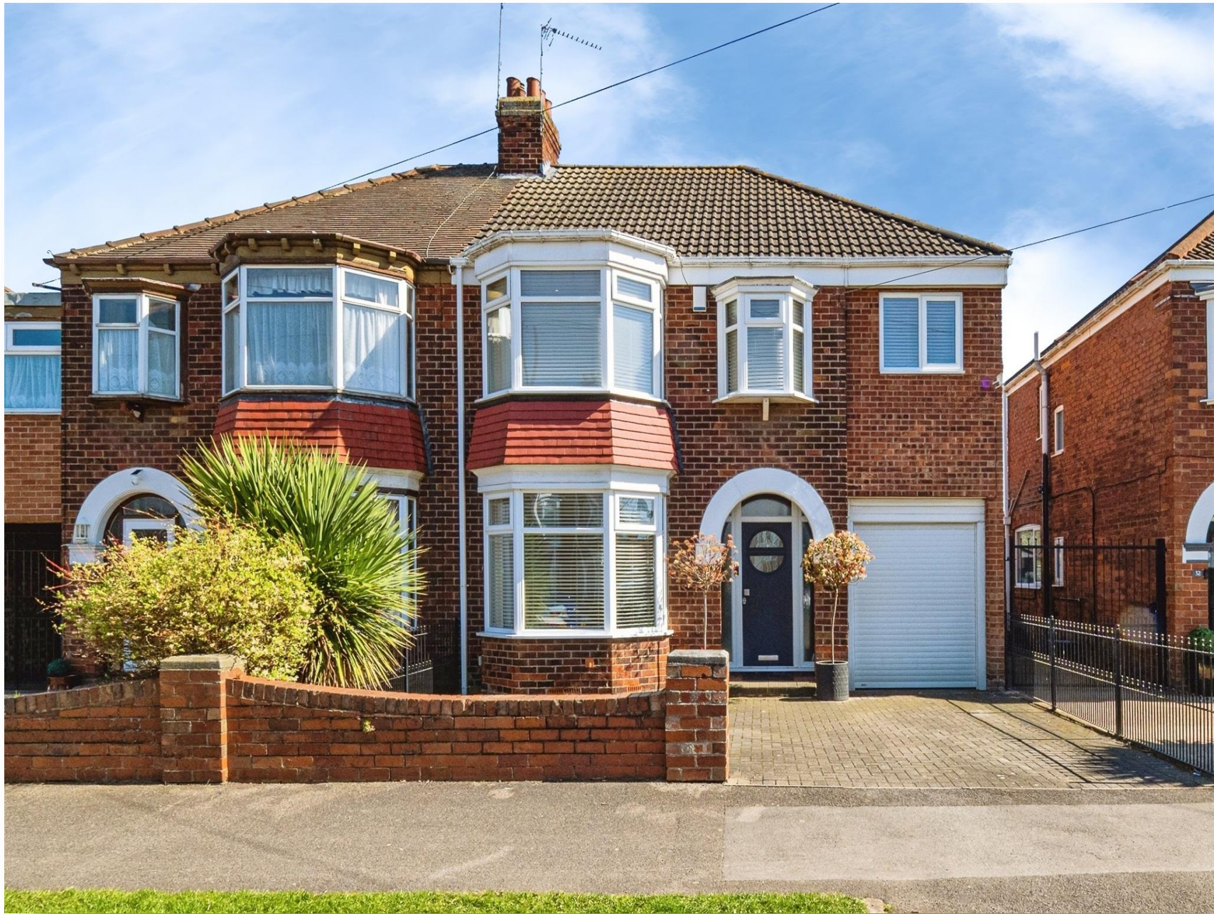
Birklands Drive, Hull, HU8 0LL