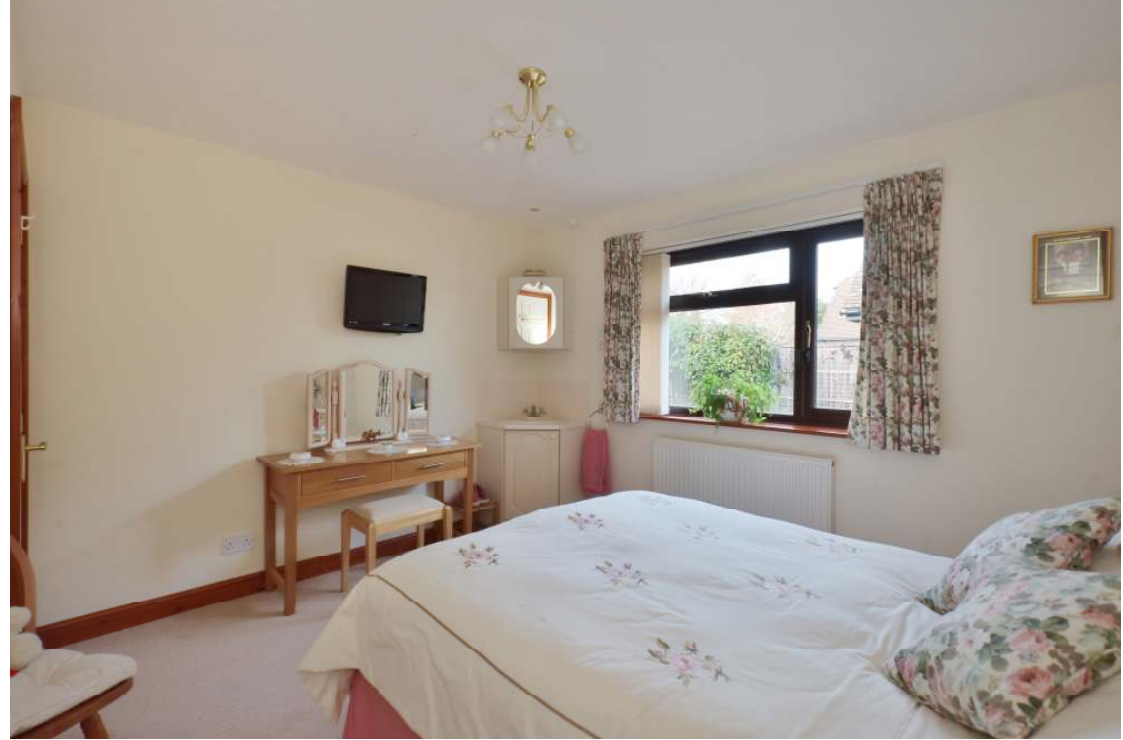
Four further bedrooms with supporting family bathroom