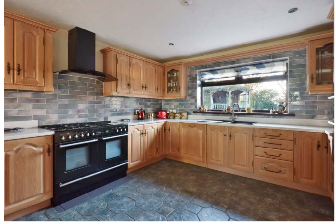
Large reception hall / Family kitchen / breakfast room and supporting dining room