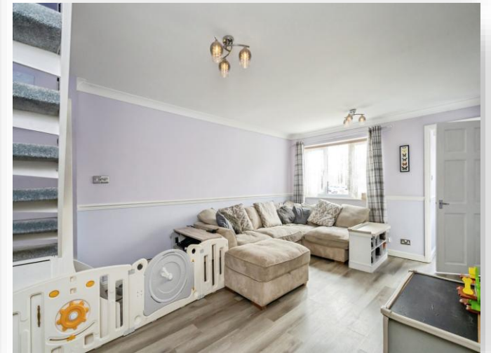
Ravens Way, Bognor Regis PO22 9ER