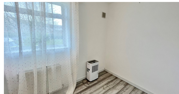
19 Crawlees Crescent