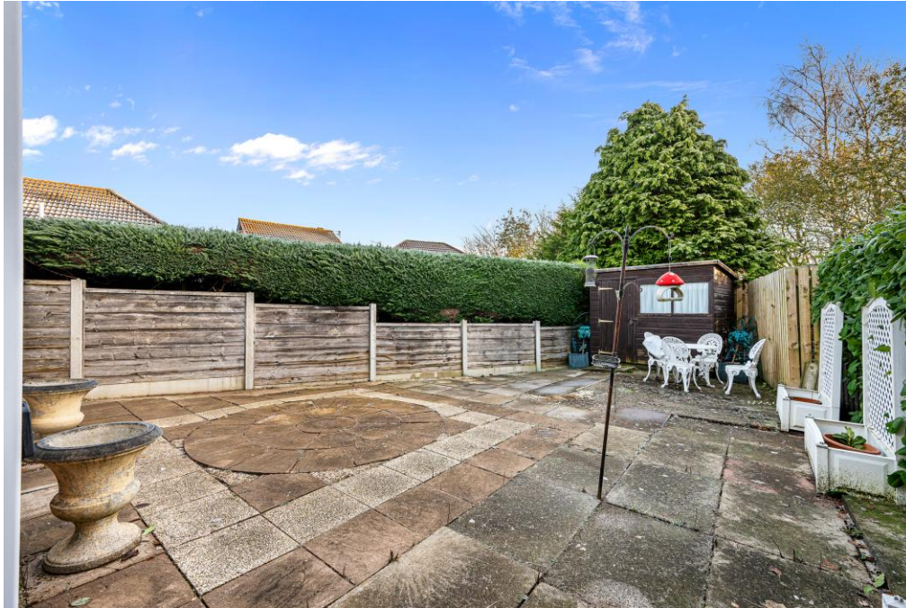
Buckingham Drive, Bury Total Approx. Floor Area 976 Sq.ft. (90.6 Sq.M.)

Rostons Ltd for themselves and the vendors of the property, give notice that these particulars, do not constitute any part of an offer or contract, that all statements contained in these particulars as to the property are made without responsibility and are not to be relied upon as statements or representations of fact and that they do not make or give any representation or warranty what so ever in relation to this property. An intending purchaser must satisfy themselves by inspection or otherwise as to the correctness of each of the statements contained within these particulars. The Agent has not tested any apparatus, equipment, fixture, fittings or services and