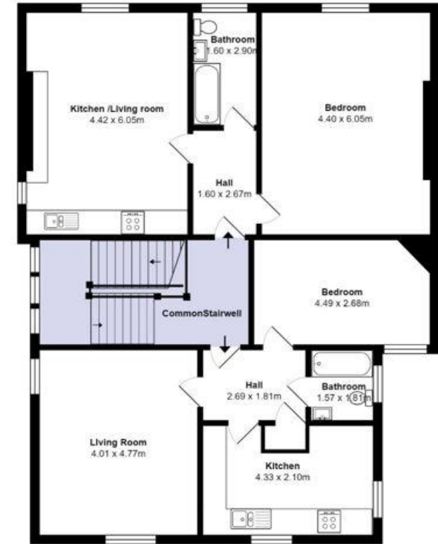
Flat 6 Total Area 52.8 m 2

7B WAVERLEY STREET FLATS 1, 2, 4, 5 AND 6 – FLOORPLAN