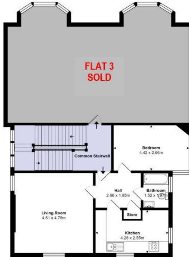
Flat 4 Total Area 52.8m 2