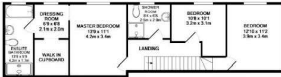
1ST FLOOR APPROX. FLOOR AREA 710 SQ. FT. (65.3 SQ.M.) TOTAL APPROX. FLOOR AREA 1737 SQ. FT. (161.4 SQ.M.) Made with Metropac C2015