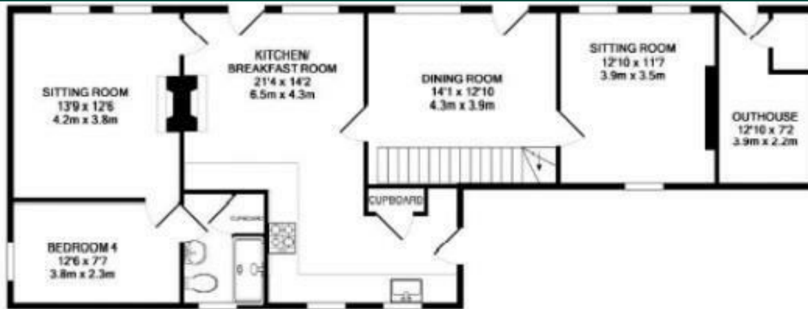
GROUND FLOOR APPROX. FLOOR AREA 1027 SQ. FT. (95.4 SQ.M.)