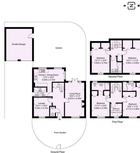
ILLUSTRATION FOR IDENTIFICATION PURPOSES ONLY ALL MEASUREMENT ARE MAXIMUM, AND INCLUDE WINDOW BAYS AND WARDROBES WHERE APPLICABLE THIS PLAN MUST NOT BE REPRODUCED BY ANY OTHER PERSON WITHOUT PERMISSION

Forge Close, Wheldrake, York Approximate Gross Internal Area = 160.4 sq m / 1726 sq ft