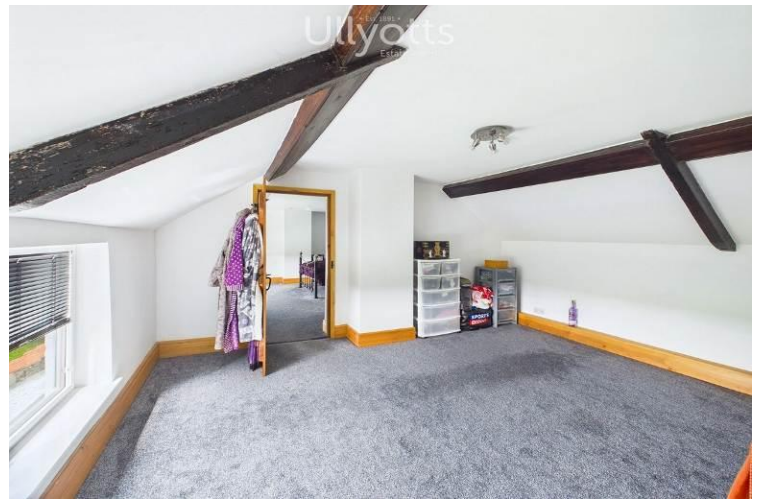
Dressing Room/Bedroom 2