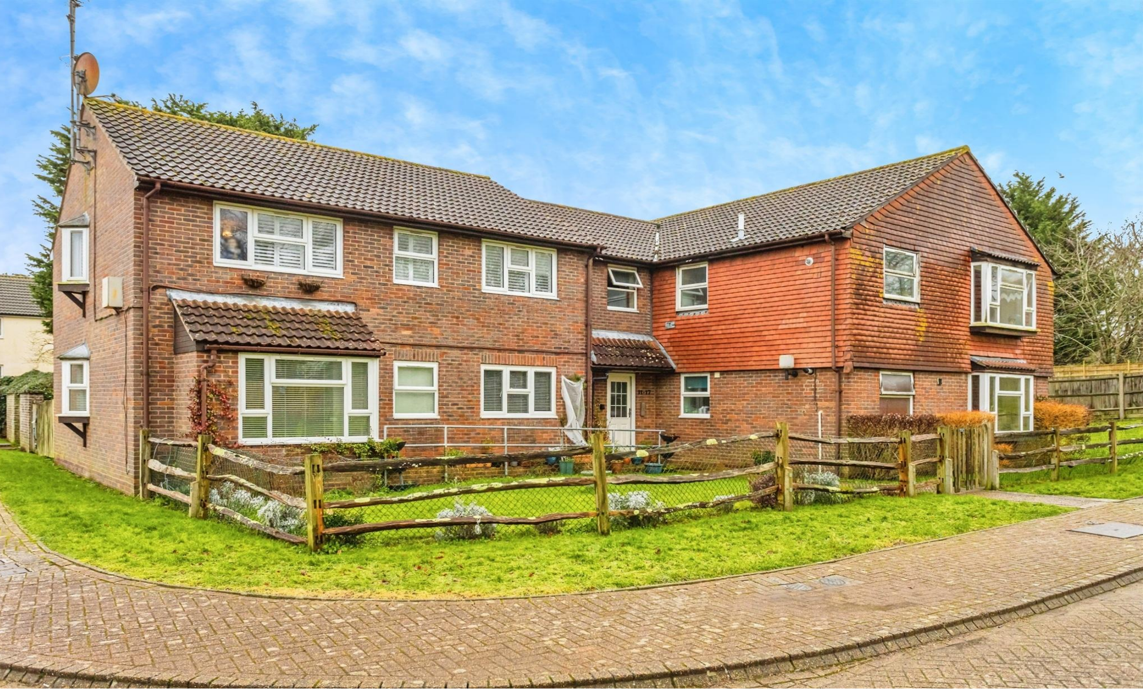
Blackthorns, Hurstpierpoint Hassocks BN6 9TF