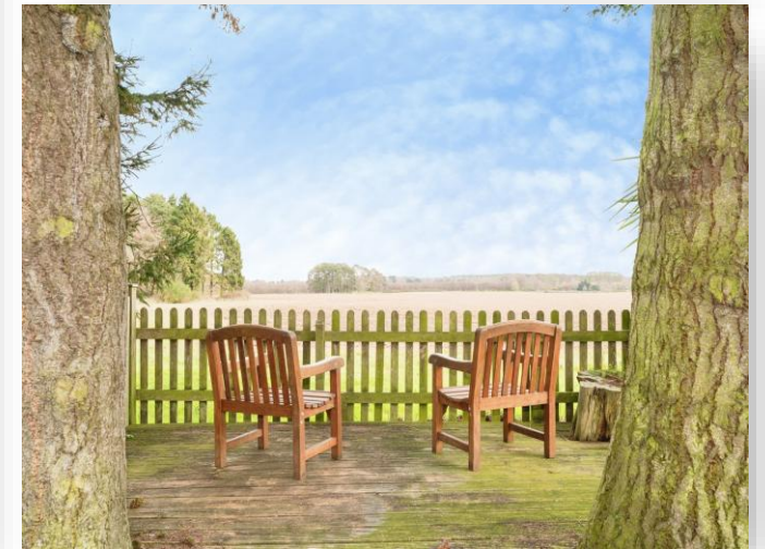
Bridge Cottages, Bridge Road, High Kelling, Holt, NR25 6QT