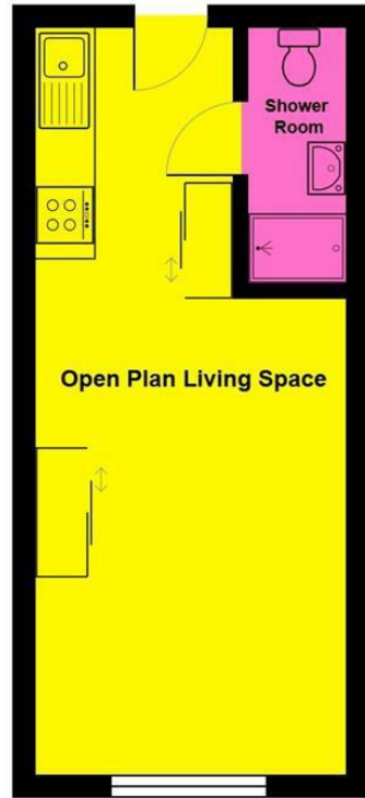
Fleet Street, Leicester, LE1 3AZ

All measurements are approximate and for display purposes only