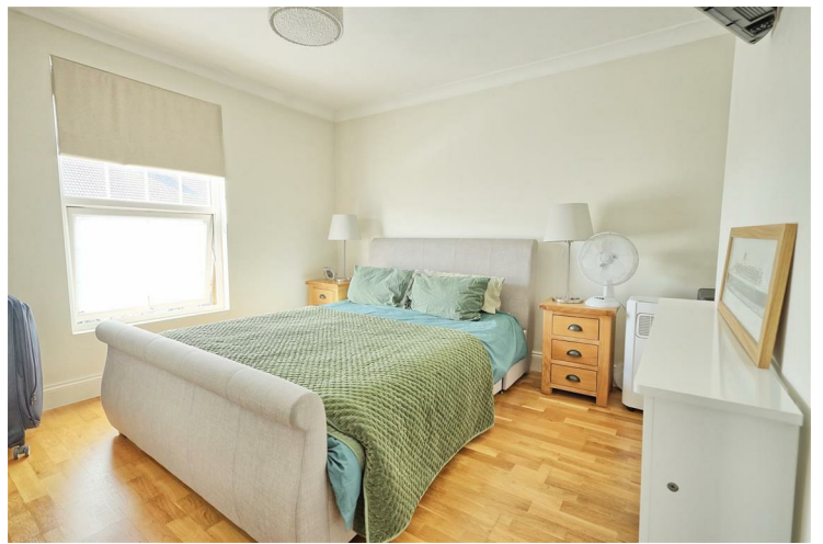
BEDROOM ONE 12'1" x 10'9" (3.7 x 3.28)