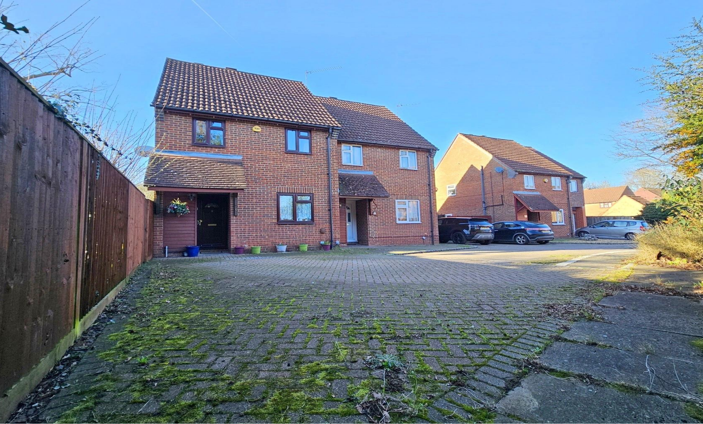
Carland Close, Lower Earley Reading RG6 4EL