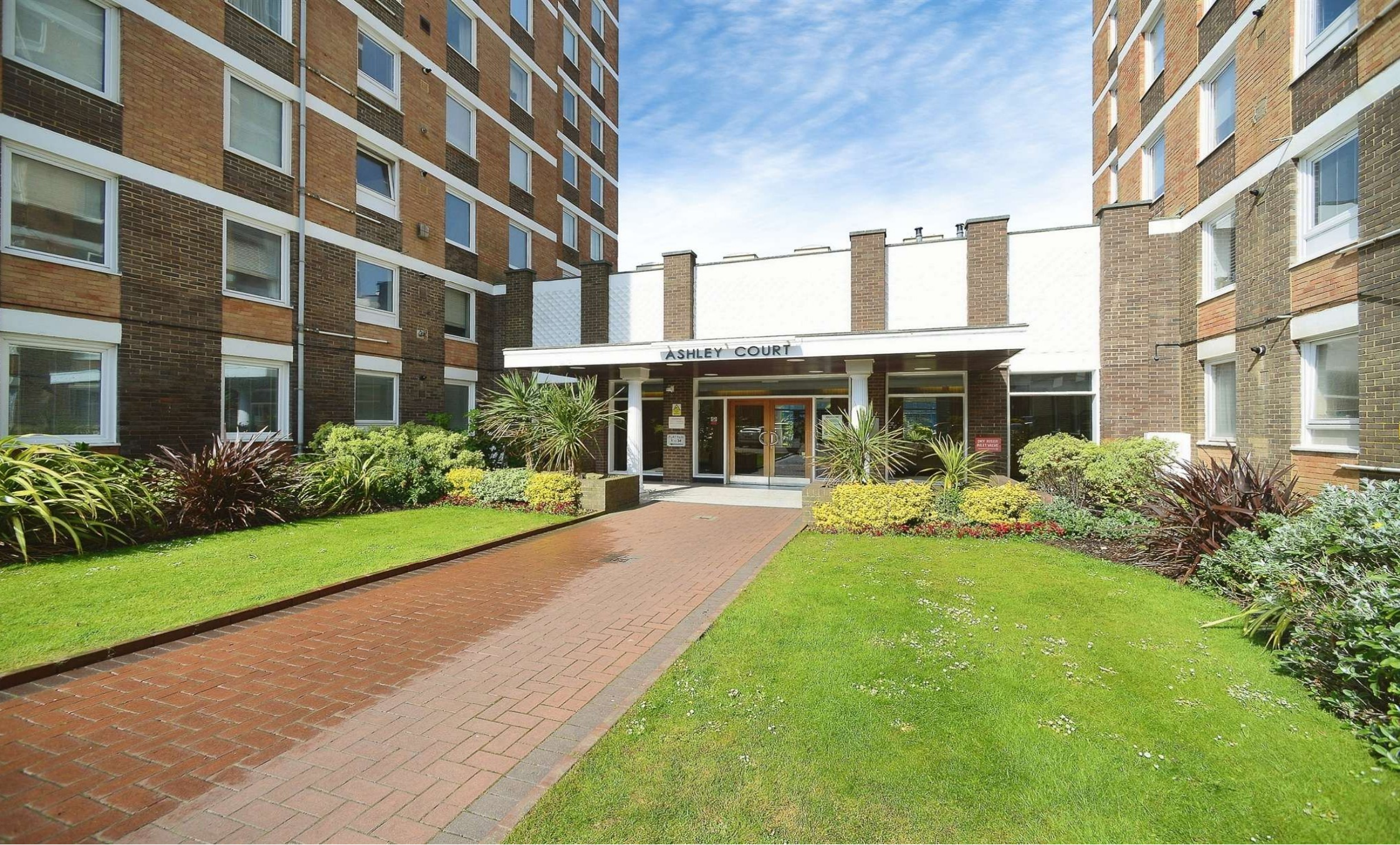
Ashley Court Grand Avenue, Hove BN3 2NQ