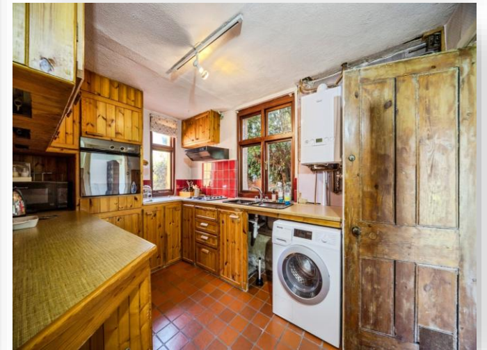
Priory Street, Newport Pagnell, MK16 9AF