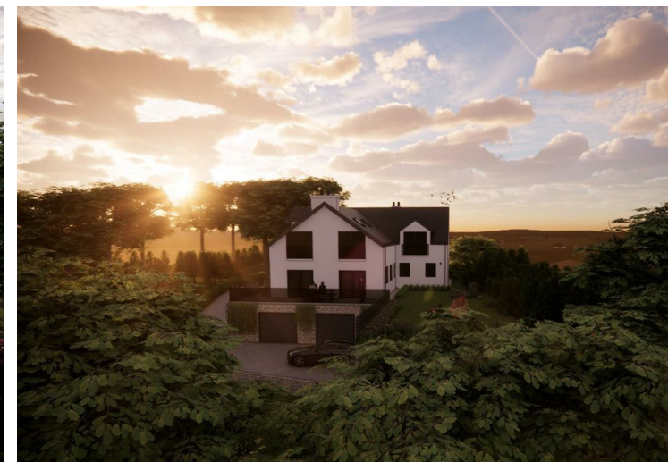
**CGI Images show potential build**

An opportunity to purchase a generous plot located in an elevated position on the outskirts of Keeton. Measuring approximately 0.7 acres, the plot currently houses a detached two-bedroom property which is in need of modernisation but has the potential for renovation and extension.