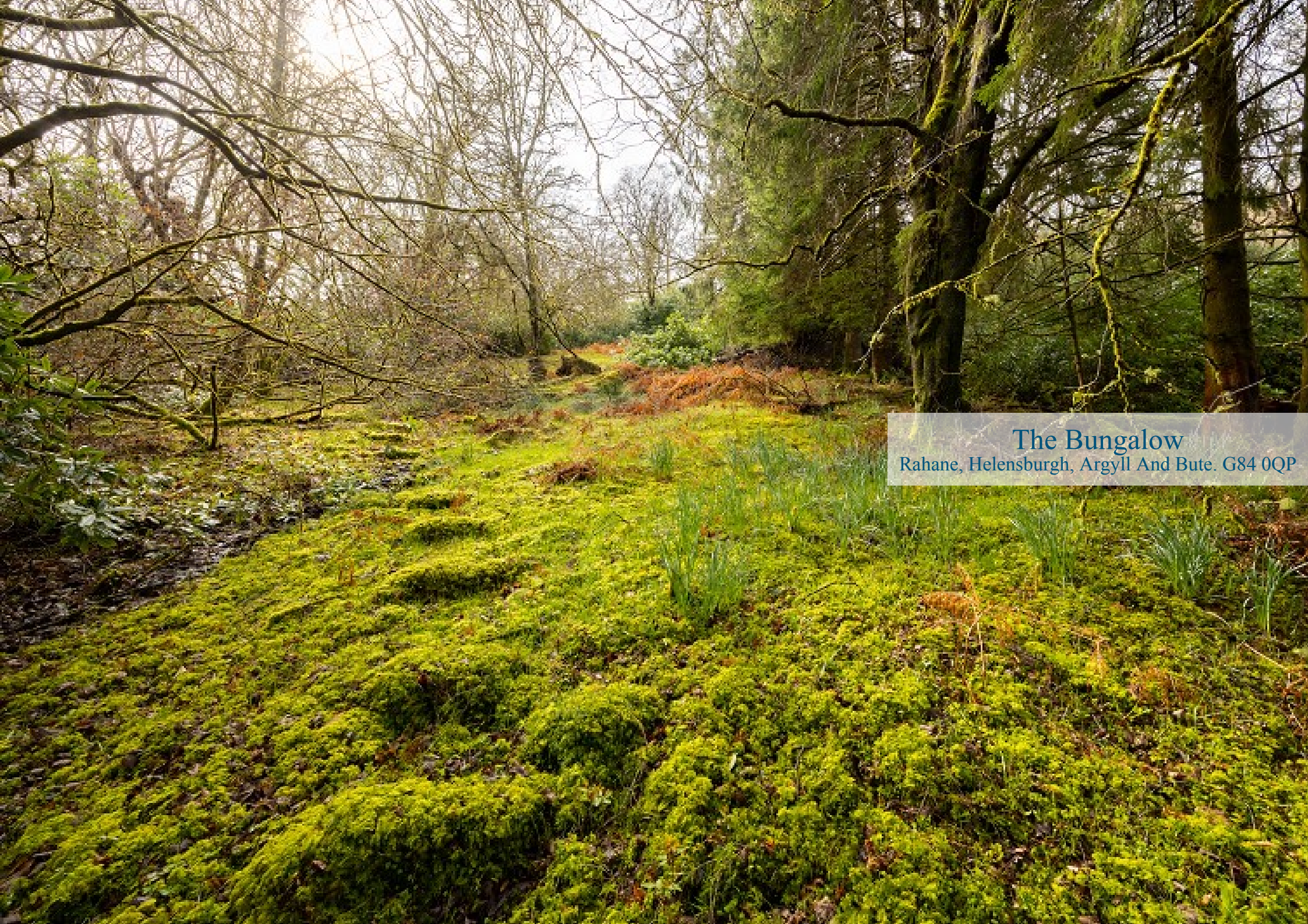
The Bungalow Rahane, Helensburgh, Argyll And Bute. G84 0QP