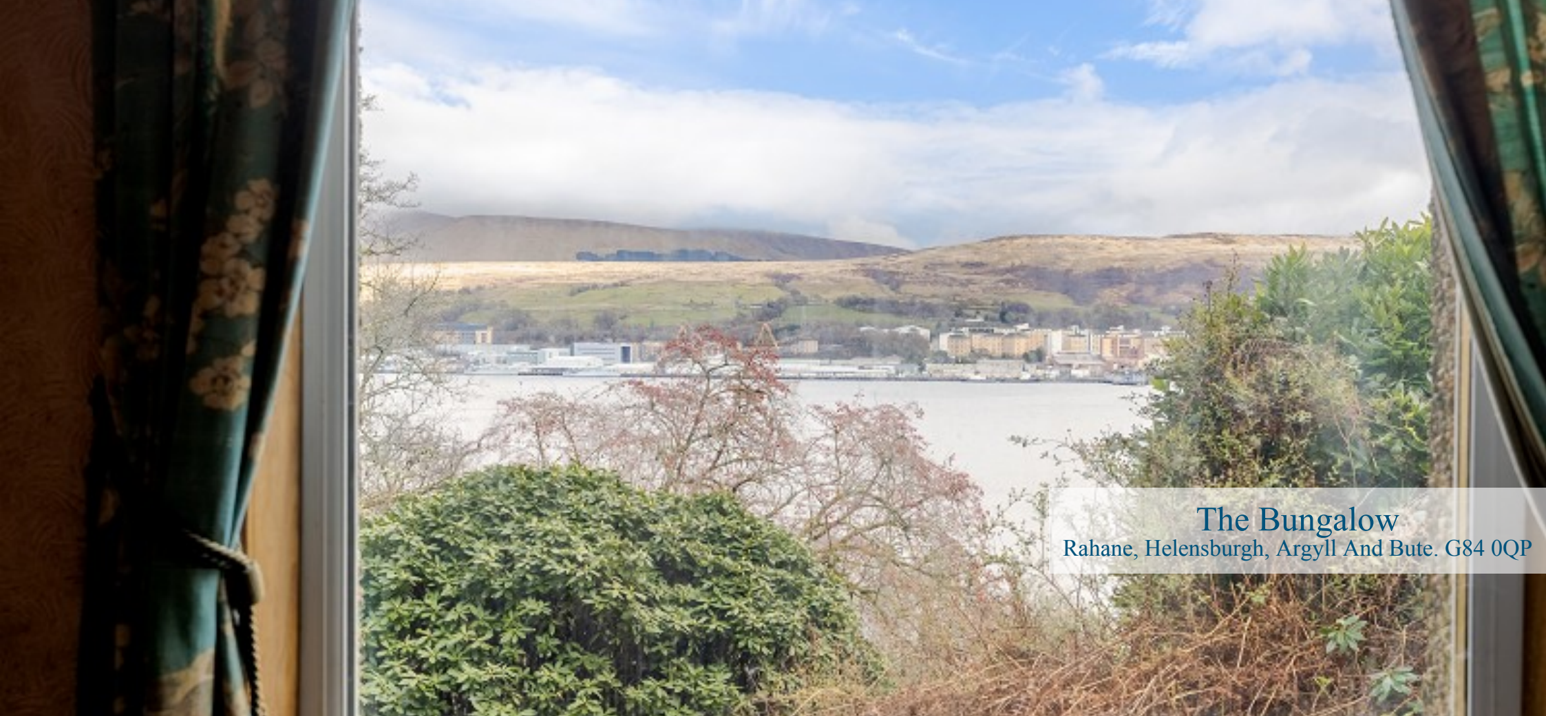
The Bungalow Rahane, Helensburgh, Argyll And Bute. G84 0QP