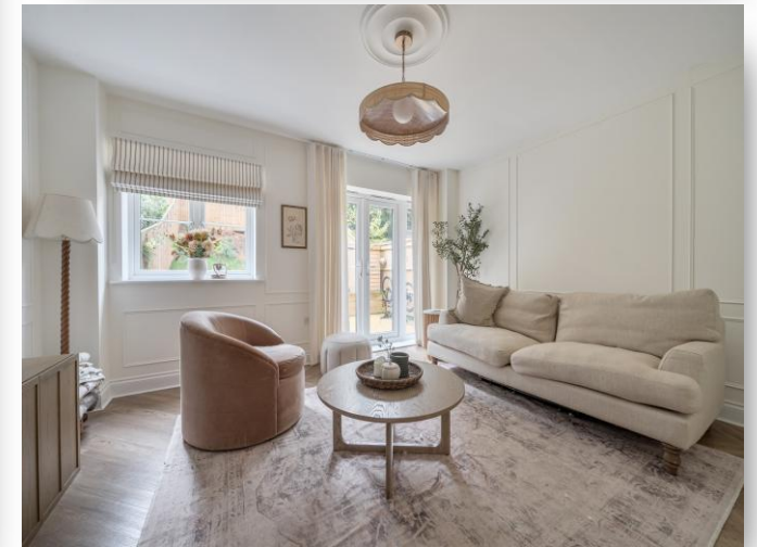
11 Godayn Grove, Maidenhead SL6 6FT