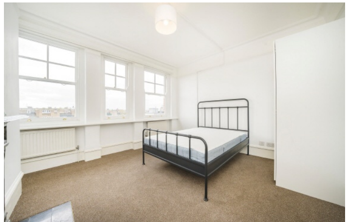
Beaumont Crescent, W14