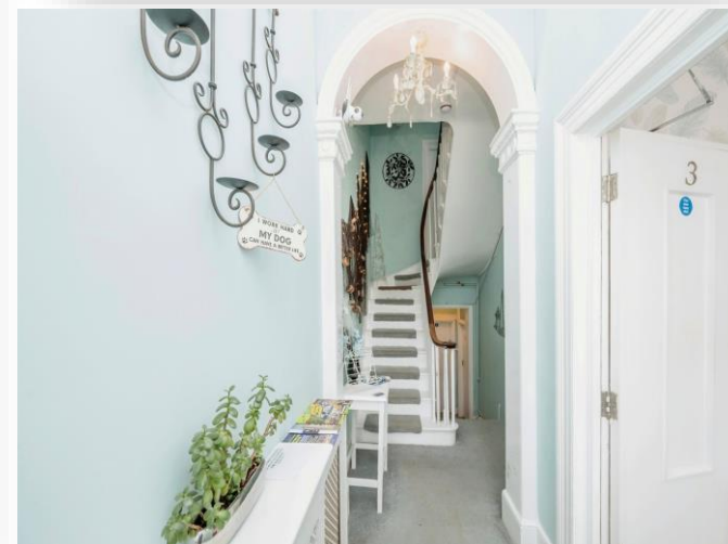
Albert Square, Great Yarmouth NR30 3JH