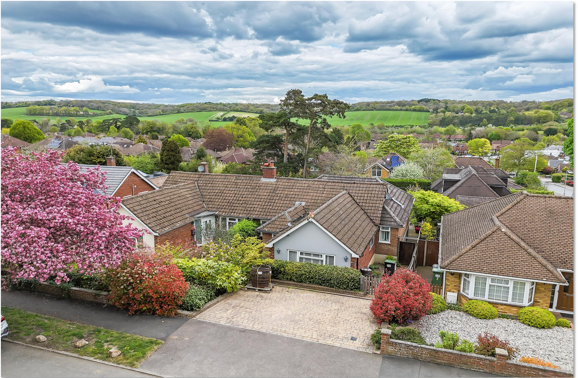
St. Marys Avenue, Northchurch Berkhamsted HP4 3RW