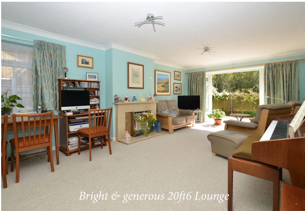
Bright & generous 20ft6 Lounge