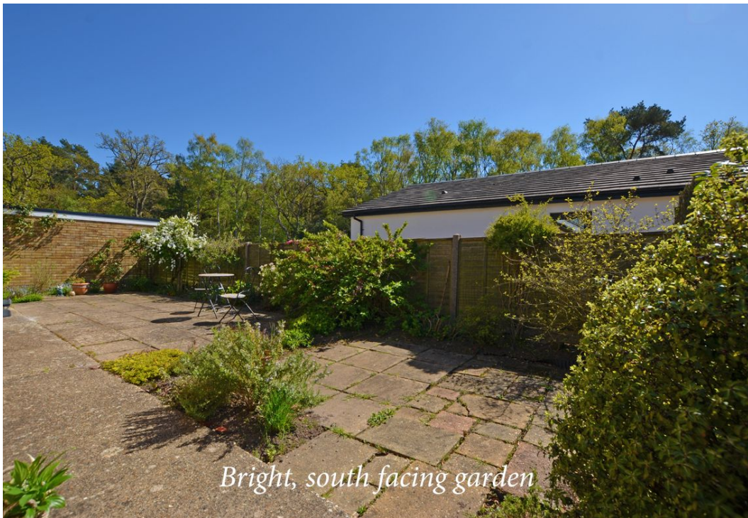
Bright, south facing garden