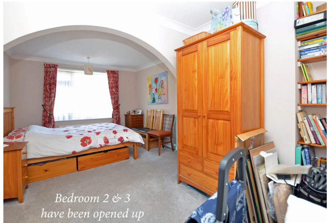
Bedroom 2 & 3 have been opened up