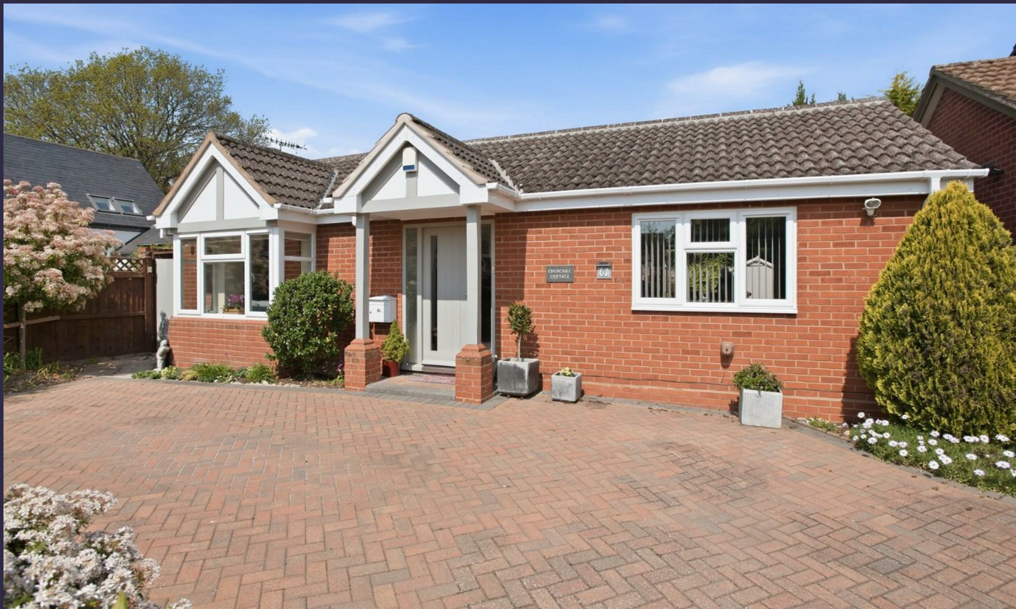
Churchill Cottage, 6A Winston Close, Shotton, Stratford-upon-Avon, CV37 9ER