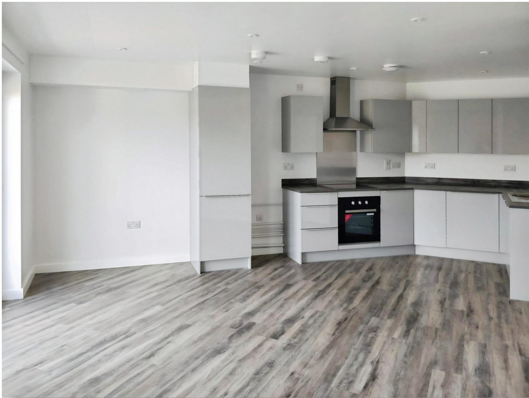
Park Avenue, Bushey, WD23 2BD