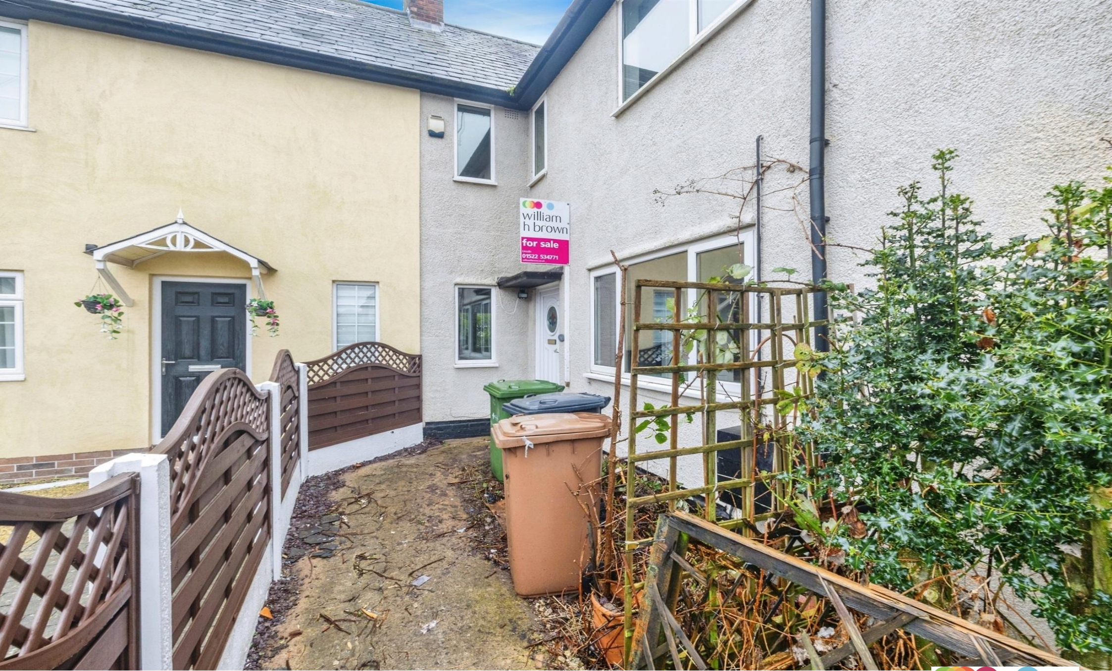
Scott Gardens, Lincoln LN2 4LX