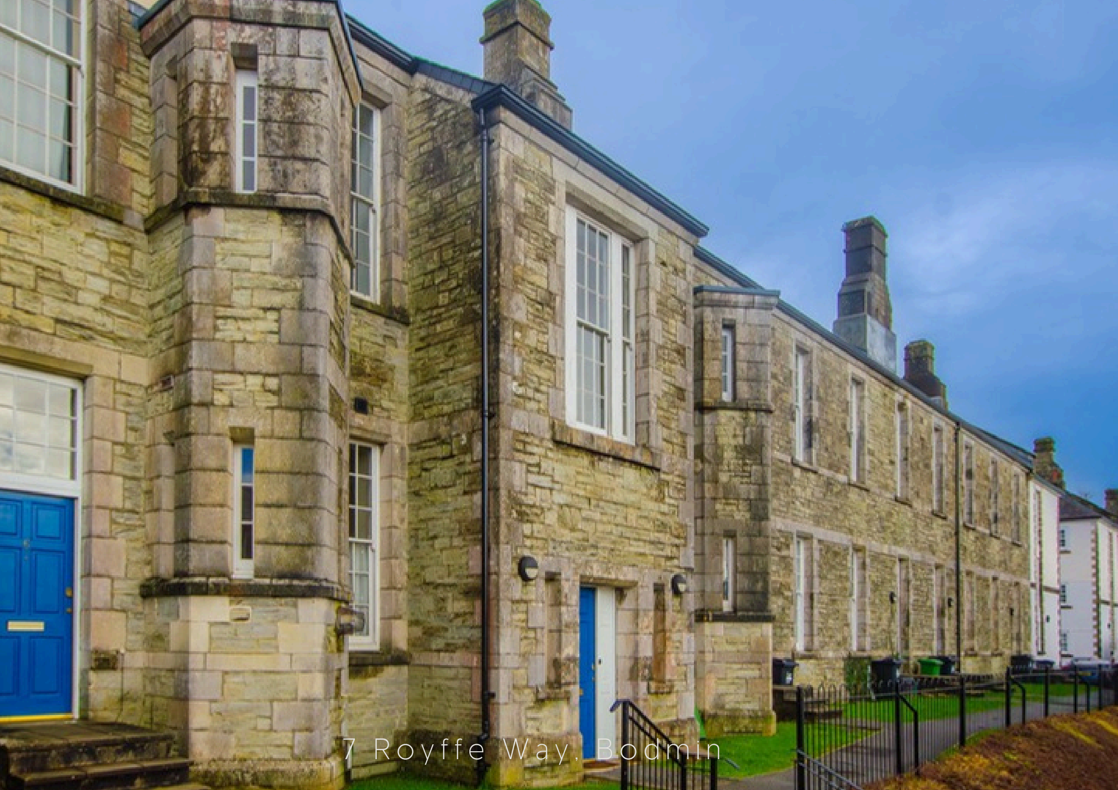
7 Royffe Way, Bodmin