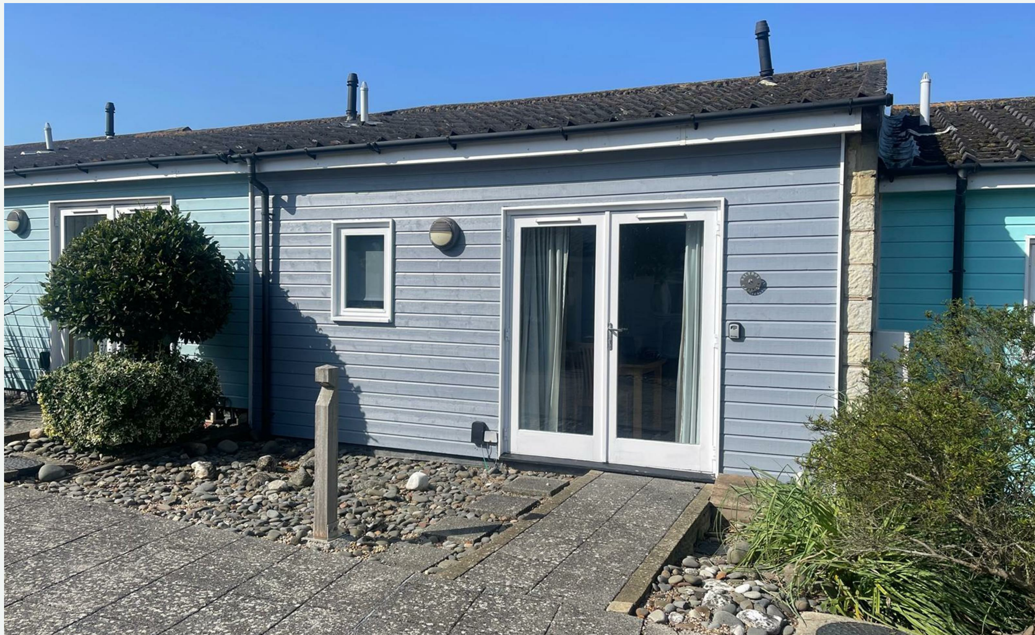
Saltbox B6, Yarmouth, Isle of Wight, PO41 0RJ