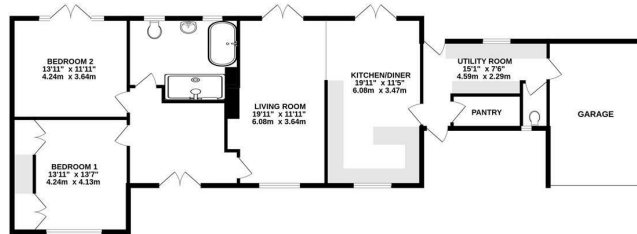
GROUND FLOOR 1394 sq.ft. (129.5 sq.m.) approx.