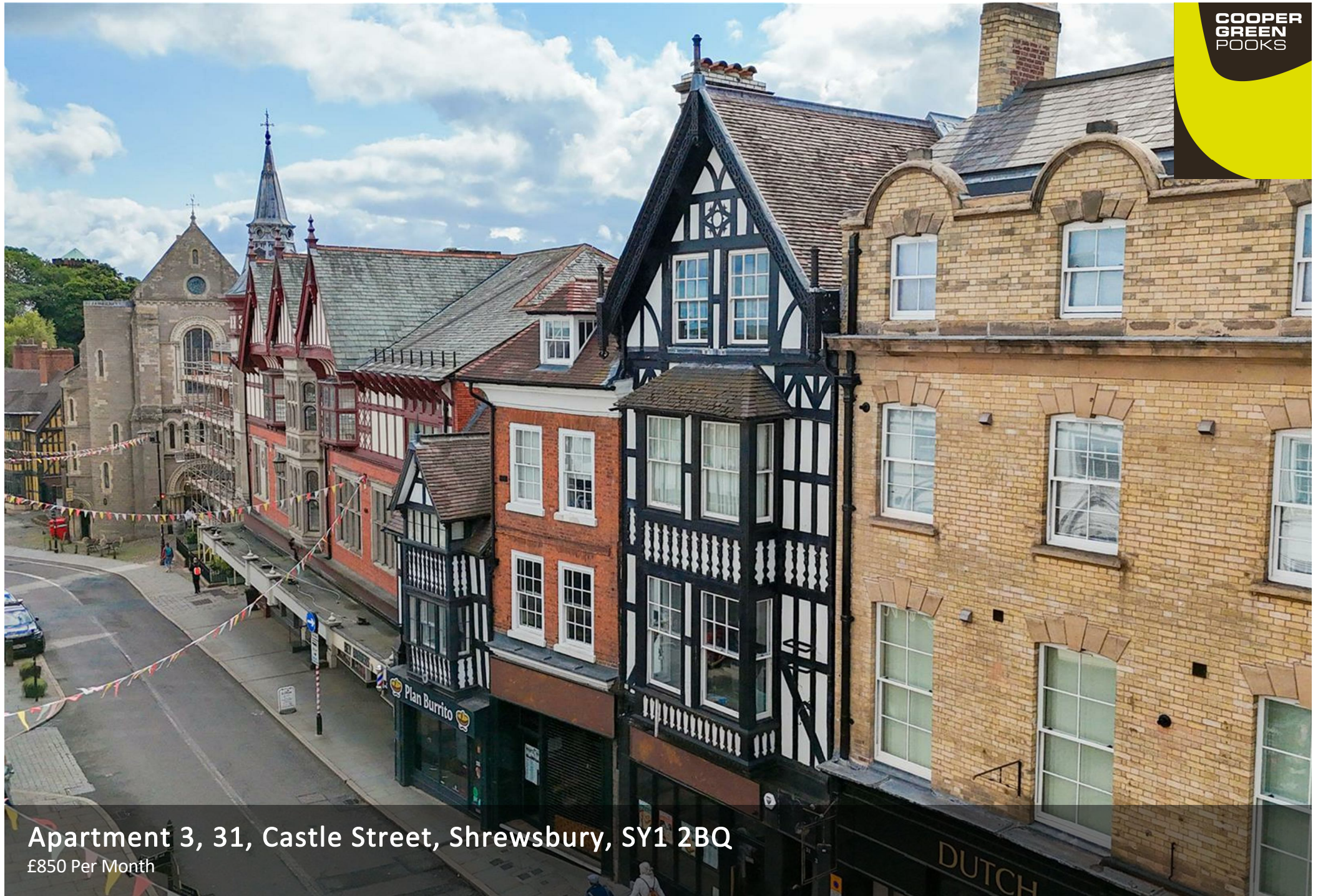
Apartment 3, 31, Castle Street, Shrewsbury, SY1 2BQ £850 Per Month