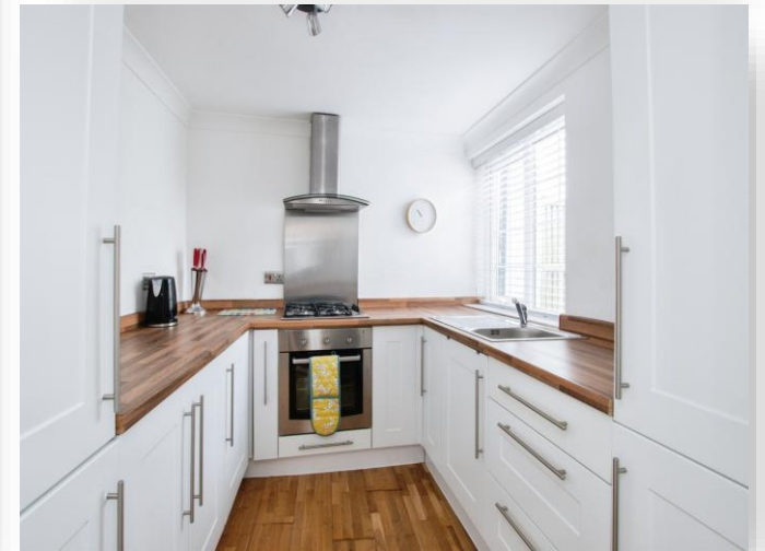
Green Lane, Fordingbridge SP6 1HT