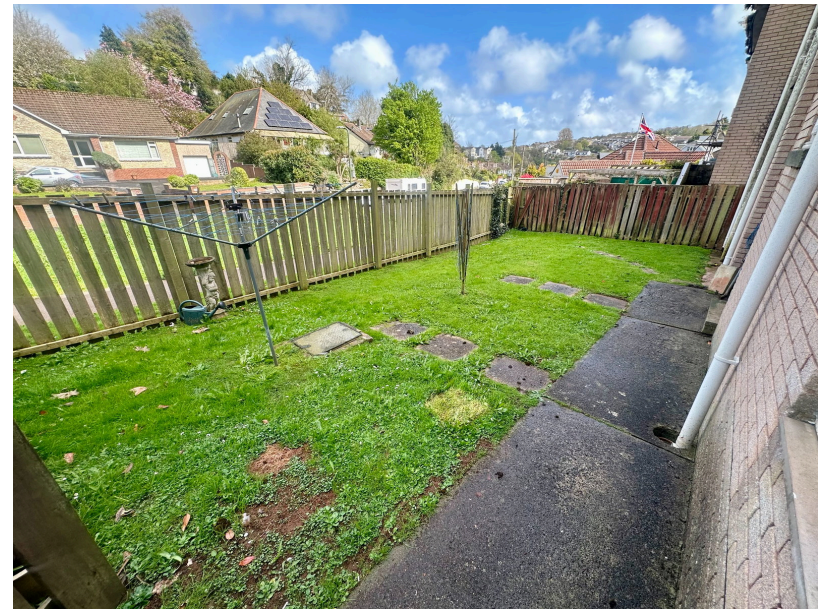
13 Dukes Close

A beautifully presented first-floor purpose-built flat, ideally located on the outskirts of Paignton with excellent access to local bus services and the wider road network. This tastefully modernised and refurbished home offers stylish, move-in-ready accommodation throughout. The property features a spacious, light-filled lounge flowing seamlessly into a quality refitted open-plan kitchen—perfect for both relaxing and entertaining. There is a generous double bedroom, a well-proportioned hallway, and a highly useful store/utility room adding valuable practicality. Further benefits include gas central heating and uPVC double glazing throughout, ensuring comfort and efficiency year-round. An excellent opportunity for first-time buyers or investors alike, this attractive home combines convenience, comfort, and contemporary living. Call to view on 01803 521111