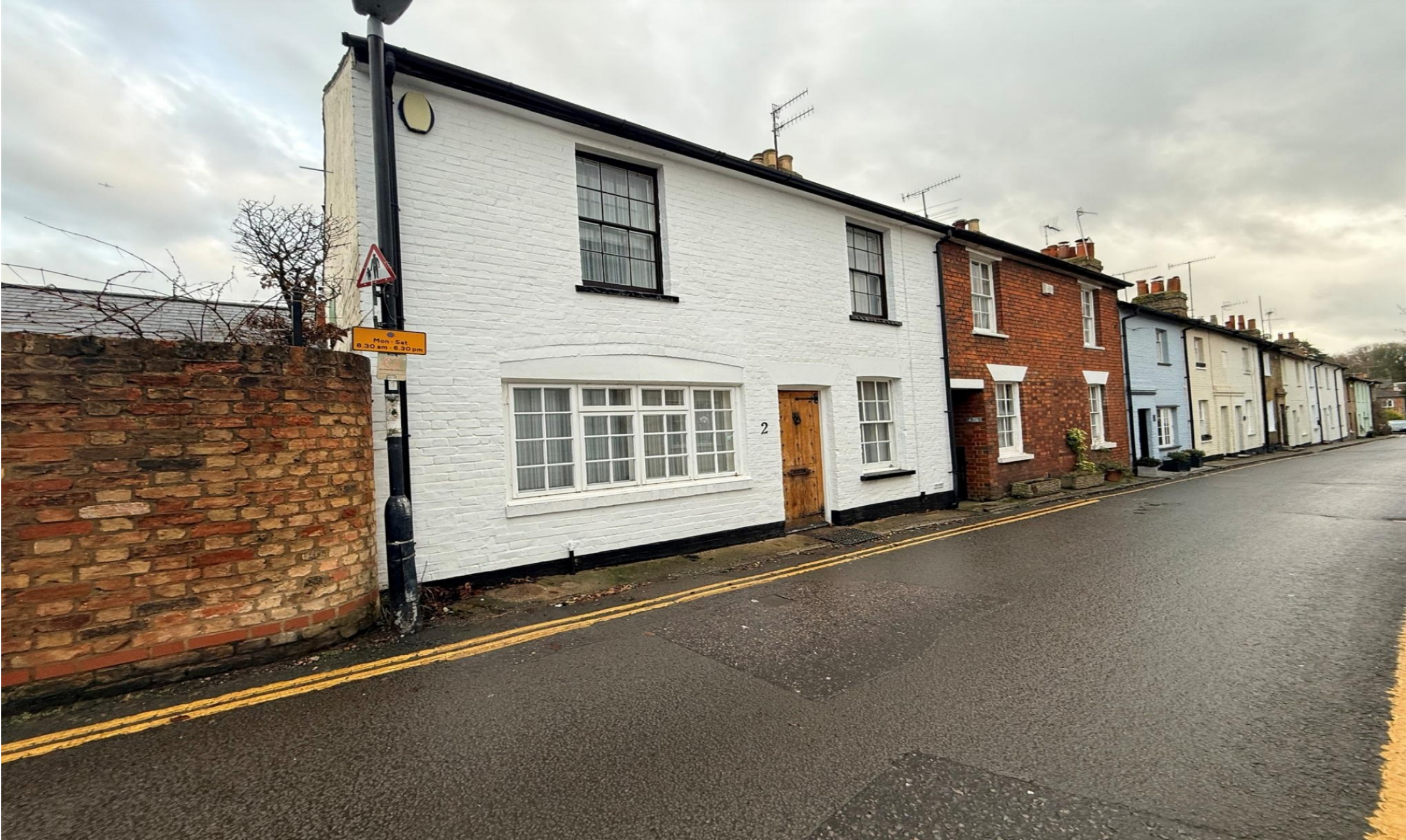
Mill Lane, Welwyn AL6 9ET