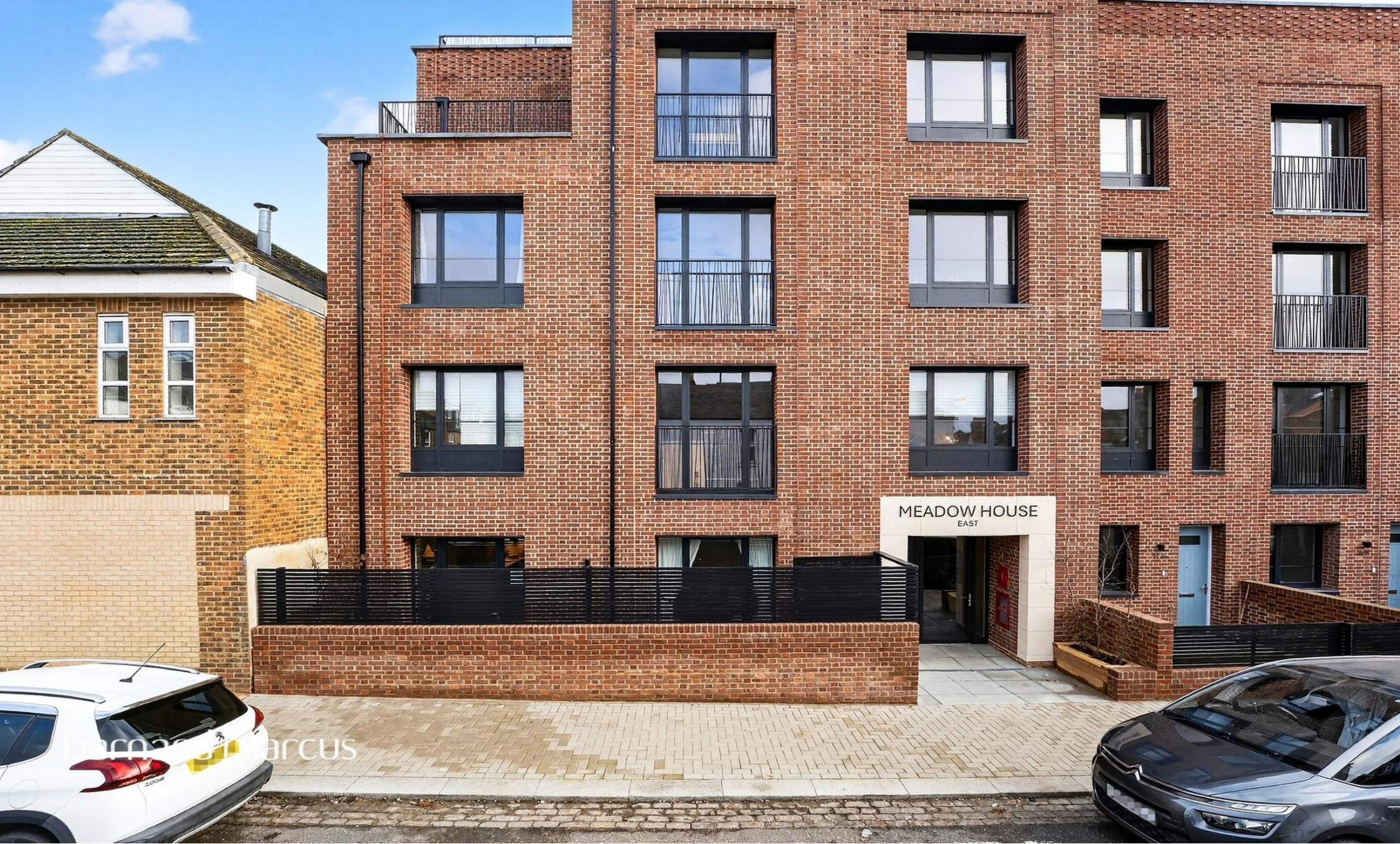
Meadow House Fallsbrook Road, London SW16 6DY