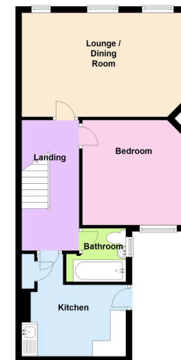
This plan is to be used only as an indication of the floor layout and is not to scale. Plan produced using PlanUp.

A Spacious First Floor Flat situated within level walking distance of the town centre and the sea front. Accommodation briefly comprises; Hallway, Double Bedroom, Kitchen, Bathroom, spacious Lounge/ Dining Room, small Parking space to the Rear and Garden to the Front. I need of a little sprucing up but a great little buy for a home or an investment. NO CHAIN !