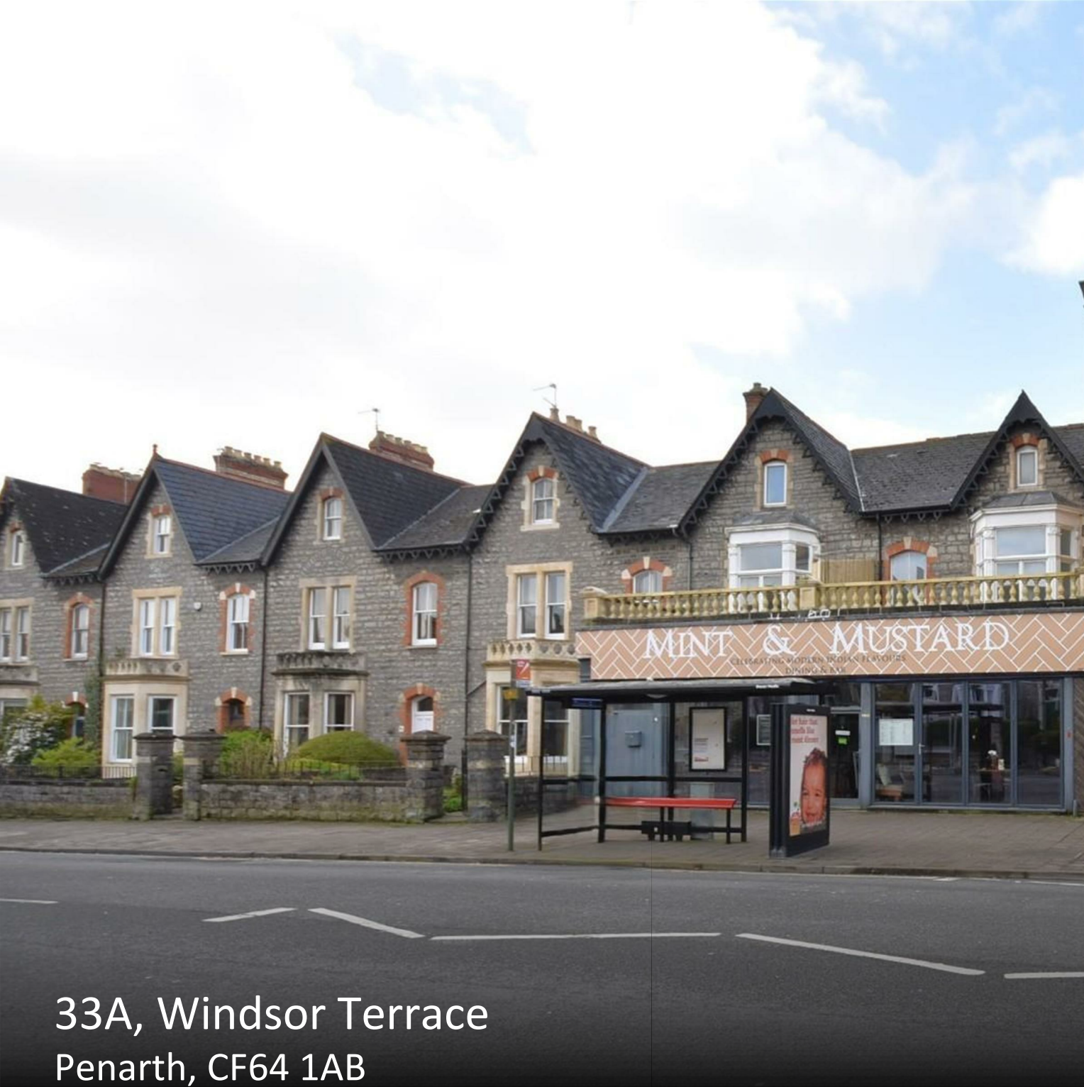
33A, Windsor Terrace Penarth, CF64 1AB