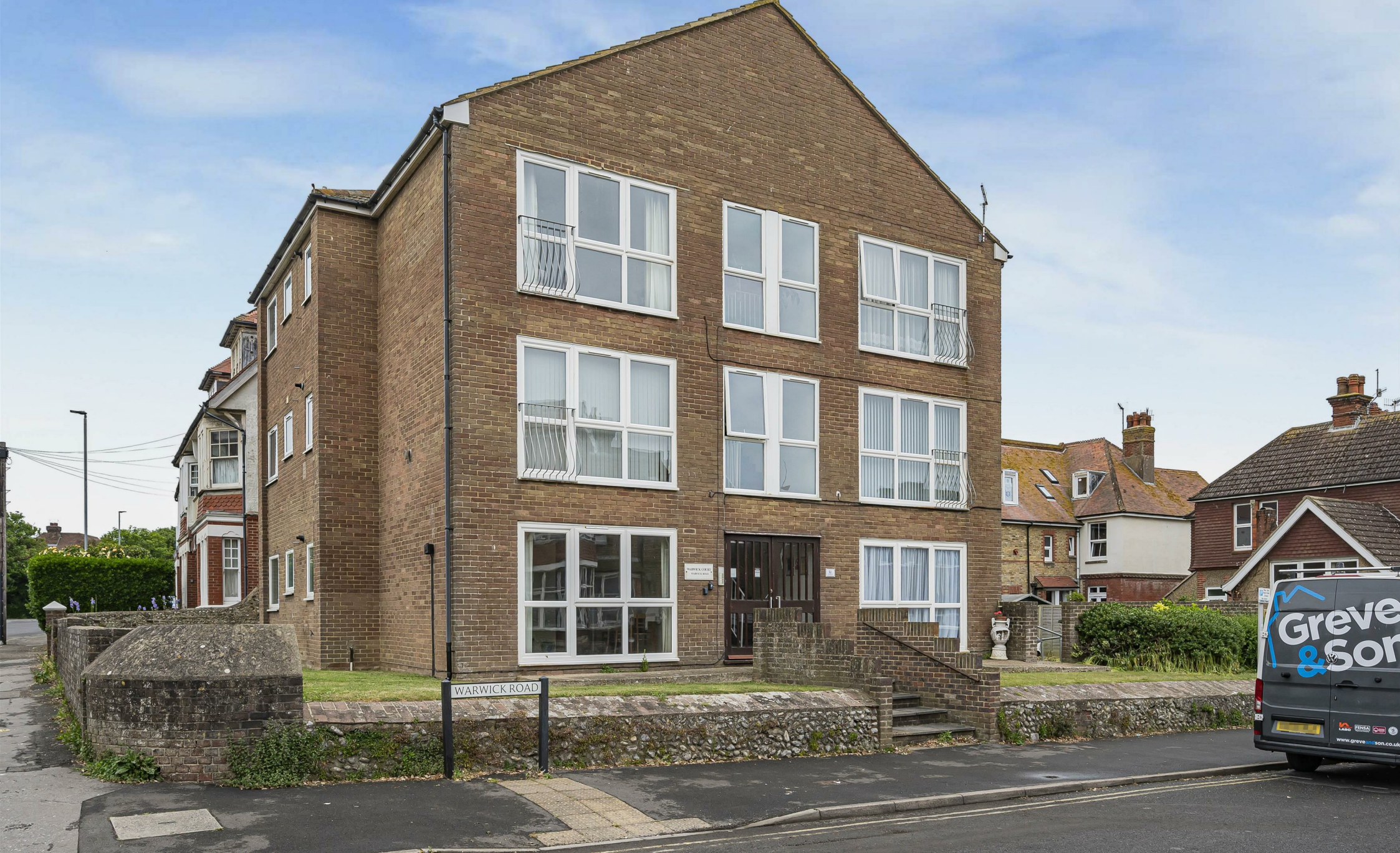
F5 Warwick Court Warwick Road, Seaford, BN25 1RG