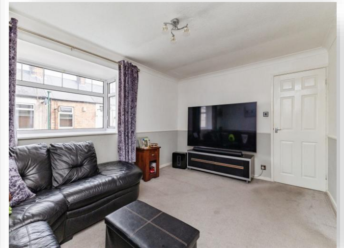
Hewley Street, Middlesbrough TS6 0RD