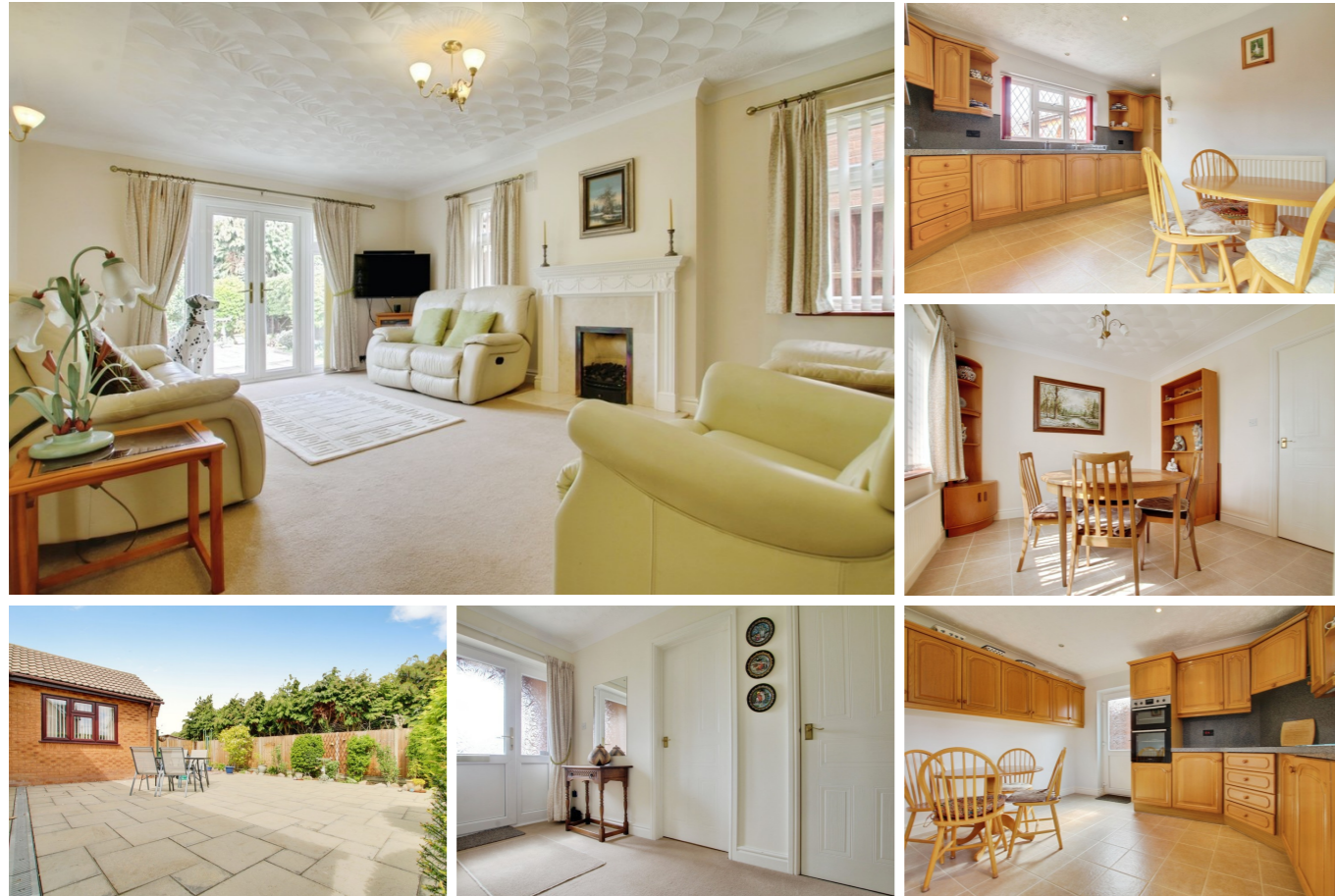
Ground Floor Approx. 123.5 sq. metres (1329.2 sq. feet)

The Cherries, Church Lane, Doddington, Cambridgeshire PE15 0PS