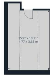
First Floor Building 2