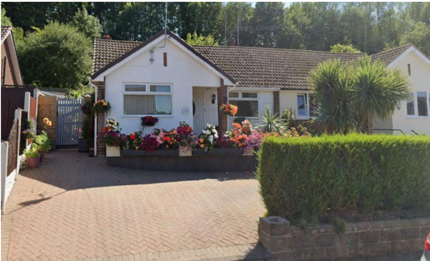
Photo from summer months