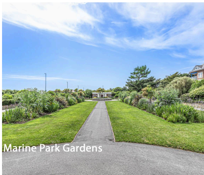
Marine Park Gardens