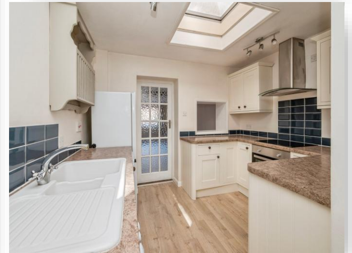
Millgate, Aylsham, Norwich, NR11 6HX