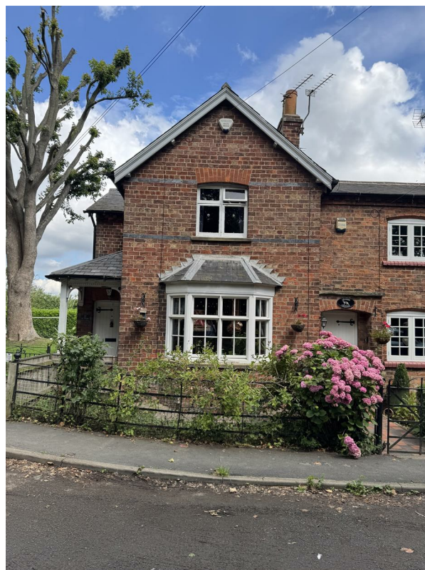
PHOTO TAKEN BY THE VENDOR DURING THE SUMMER

PLEASE NOTE THESE ARE DRAFT PARTICULARS AWAITING FINAL APPROVAL FROM THE VENDOR, THEREFORE THE CONTENTS HEREIN MAY BE SUBJECT TO CHANGE AND MUST NOT BE RELIED UPON AS AN ENTIRELY ACCURATE DESCRIPTION OF THE PROPERTY.