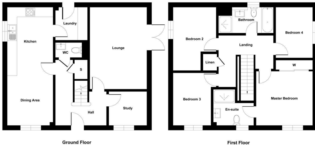
Illustration for identification purpose only, measurements approximate and not to scale, unauthorized reproduction is prohibited. All rights reserved for Alexander Hudson Estates

Backworth Park is part of the historic village of Backworth, known for its mining heritage. The modern development has created a thriving residential community with contemporary homes, local shops, and leisure facilities including The Pavilion Bar & Grill, Costa Coffee, and a local retail centre. Coastal towns such as Whitley Bay and Tynemouth are a short drive away, while the A19, A1, and Northumberland Park Metro Station provide excellent commuting options. Families benefit from nearby primary and secondary schools, making Backworth Park a convenient and attractive location with a strong sense of community, just a stone's throw from the coast.